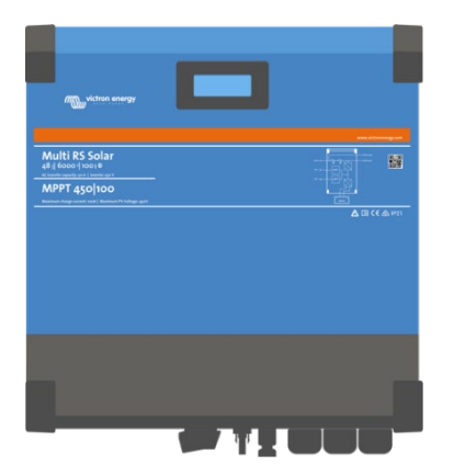
Multi RS Solar 48/6000 dual tracker